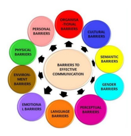
Figure 2: Different Types of Barriers

The above mentioned organizational barriers are important in themselves but there are some barriers which are directly connected with the sender and receiver. They are called personal barriers.