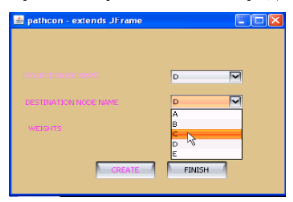
Figure 1.6 Packet path construction with weight (B)