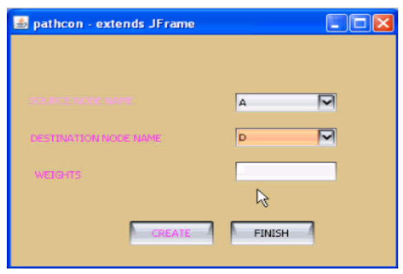
Figure 1.5 Packet path construction with weight (A)