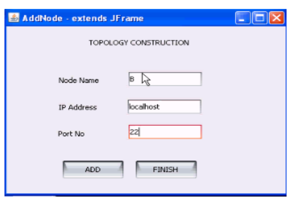
Figure 1.4 Different Node Creation

1.10 Figure Screen shots of Implemented System