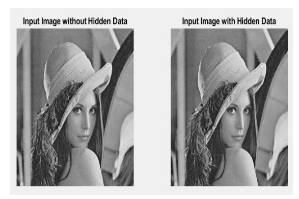
Figure 2: Input Image with and without Hidden Data.

The visual quality for all six images has been preserved, Figure 2 and Figure 3 Shows the visual quality and histogram of Lena image.